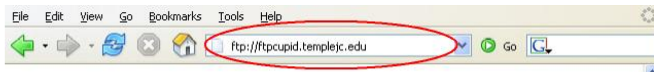
Figure 2 - Firefox Address Textbox