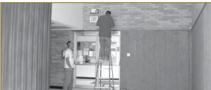
MAMPAC Workmen working on lobby renovations. Need outline

At intermission, the symphony will play an arrangement of Happy Birthday that is being created just for her and the audience will be invited to sing along. This is an event you won't want to miss!